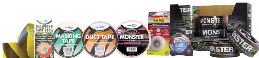
Part of the Bond It Tape Range

The data presented in this leaflet are in accordance with the present state of our knowledge, but do not absolve the user from carefully checking all supplies immediately on receipt. We reserve the right to alter product constants within the scope of technical progress or new developments. The recommendations made in this leaflet should be checked by preliminary trials because of conditions during processing over which we have no control, especially where other companies raw materials are also being used. The recommendations do not absolve the user from the obligation of investigating the possibility of infringement of third parties rights and, if necessary clarifying the position. Recommendations for use do not constitute a warranty, either expressed or implied, of the fitness or suitability of the products for a particular purpose.