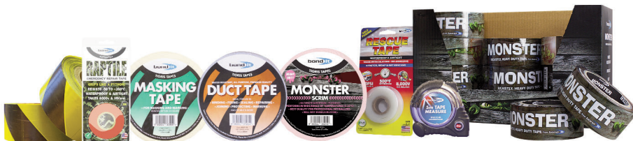
Part of the Bond It Tape Range

The data presented in this leaflet are in accordance with the present state of our knowledge, but do not absolve the user from carefully checking all supplies immediately on receipt. We reserve the right to alter product constants within the scope of technical progress or new developments. The recommendations made in this leaflet should be checked by preliminary trials because of conditions during processing over which we have no control, especially where other companies raw materials are also being used. The recommendations do not absolve the user from the obligation of investigating the possibility of infringement of third parties rights and, if necessary clarifying the position. Recommendations for use do not constitute a warranty, either expressed or implied, of the fitness or suitability of the products for a particular purpose.