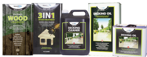
Part of the Bond It Woodguard Range

The data presented in this leaflet are in accordance with the present state of our knowledge, but do not absolve the user from carefully checking all supplies immediately on receipt. We reserve the right to alter product constants within the scope of technical progress or new developments. The recommendations made in this leaflet should be checked by preliminary trials because of conditions during processing over which we have no control, especially where other companies raw materials are also being used. The recommendations do not absolve the user from the obligation of investigating the possibility of infringement of third parties rights and, if necessary clarifying the position. Recommendations for use do not constitute a warranty, either expressed or implied, of the fitness or suitability of the products for a particular purpose.