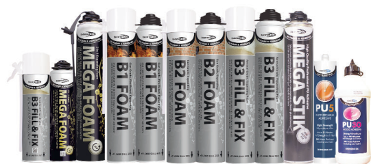
Part of the Bond It PU Foams & Adhesives Range