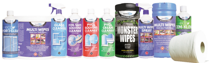
Part of the Bond It Professional Cleaning Range

The data presented in this leaflet are in accordance with the present state of our knowledge, but do not absolve the user from carefully checking all supplies immediately on receipt. We reserve the right to alter product constants within the scope of technical progress or new developments. The recommendations made in this leaflet should be checked by preliminary trials because of conditions during processing over which we have no control, especially where other companies raw materials are also being used. The recommendations do not absolve the user from the obligation of investigating the possibility of infringement of third parties rights and, if necessary clarifying the position. Recommendations for use do not constitute a warranty, either expressed or implied, of the fitness or suitability of the products for a particular purpose.