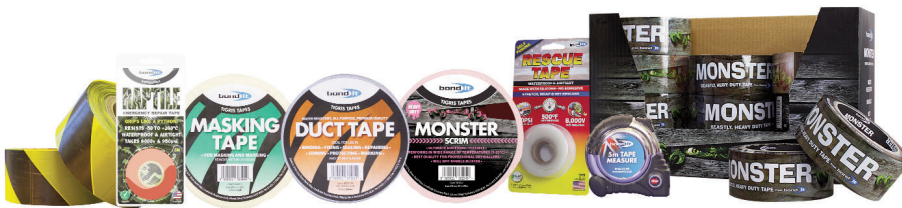
Part of the Bond It Tape Range

The data presented in this leaflet are in accordance with the present state of our knowledge, but do not absolve the user from carefully checking all supplies immediately on receipt. We reserve the right to alter product constants within the scope of technical progress or new developments. The recommendations made in this leaflet should be checked by preliminary trials because of conditions during processing over which we have no control, especially where other companies raw materials are also being used. The recommendations do not absolve the user from the obligation of investigating the possibility of infringement of third parties rights and, if necessary clarifying the position. Recommendations for use do not constitute a warranty, either expressed or implied, of the fitness or suitability of the products for a particular purpose.