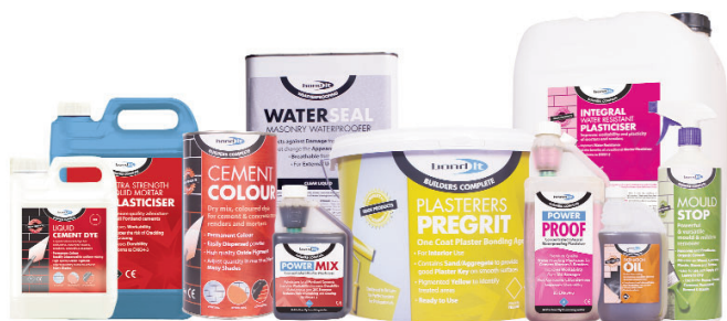
Part of the Bond It Builders Complete Range

The data presented in this leaflet are in accordance with the present state of our knowledge, but do not absolve the user from carefully checking all supplies immediately on receipt. We reserve the right to alter product constants within the scope of technical progress or new developments. The recommendations made in this leaflet should be checked by preliminary trials because of conditions during processing over which we have no control, especially where other companies raw materials are also being used. The recommendations do not absolve the user from the obligation of investigating the possibility of infringement of third parties rights and, if necessary clarifying the position. Recommendations for use do not constitute a warranty, either expressed or implied, of the fitness or suitability of the products for a particular purpose.