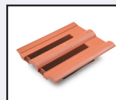
PRODUCT CODE: HD TV5/3

PLEASE SEE OVERLEAF FOR COMPATIBILITY OF ALL DANELAW TILE VENTS