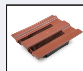
PRODUCT CODE: HD TV15/4