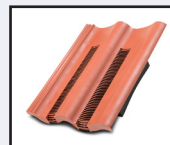
PRODUCT CODE: HD TV15/2