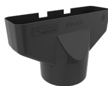
Standard Adapter RTV-ADS