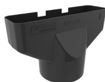
Standard Adapter RTV-ADS