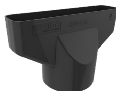
Plain Adapter RTV-ADP