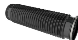
110mm Flexipipe RTV-KIT1