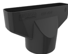
Plain Adapter RTV-ADP

NB. RTV-P available in single, pack or pallet quantities. For pack quantities, 14 tile vent assemblies are packaged in one large box.