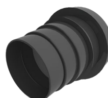
Multi Adapter RTV-ADMULTI

NB. Available in single, pack or pallet quantities.