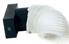
Pipe Adapter Kit 4101